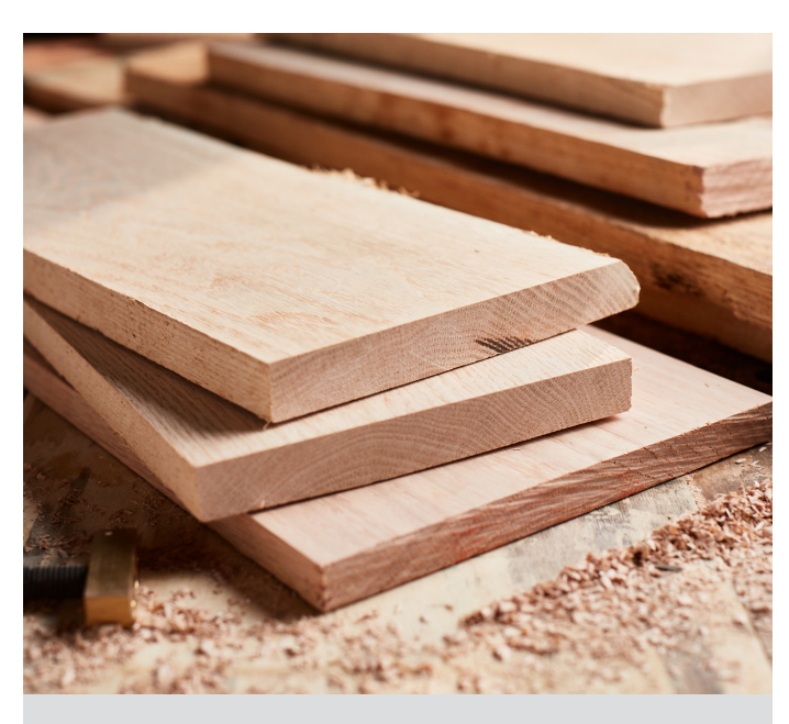
Systems like FSC easy to manipulate as they rely on annual paper-based audits

notable for being published by NepCon, a certifying organisation and a leading advocate of FSC certification. The article highlights that where corruption is endemic, and someone wants to commit fraud intentionally, it is easy to manipulate a system like FSC which relies on annual paper-based audits.