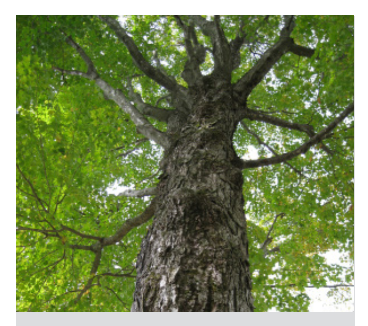
AHEC's updated Seneca Creek study aims to facilitate U.S. hardwoods' continuing market access

AHEC has consistently highlighted the value of a "risk-based" approach to provision of assurances of legal and sustainable timber sourcing, particularly when dealing with products from non-industrial forest owners or composite products for which it is not possible to trace fibre back to specific forest management units.