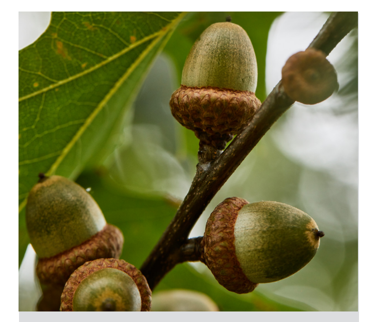
Over 90% of hardwood supply in the United States derives from non-industrial landowners

<sup>2</sup> Real Estate Investment Trusts