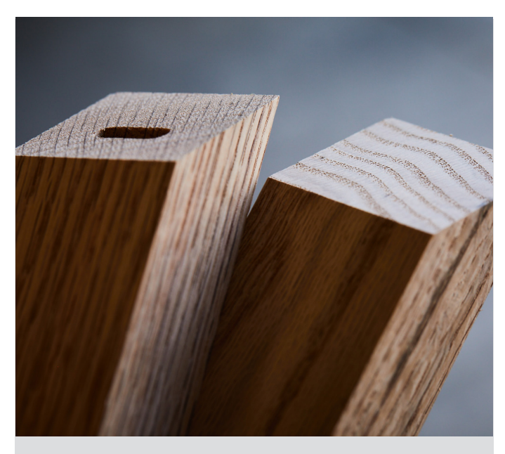
For more information, visit the AHEC website

According to the 2017 Seneca Creek report "We know of no other country in the world that trades in hardwood products that has as robust, consistent, and current data on its forest resources as are available through the FIA program in the United States".