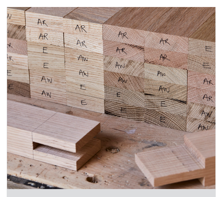
All data used for AHEC's online tools were drawn from verifiable resources

The LCA study of the cradle-to-gate environmental impacts of delivering U.S. hardwood lumber and veneer into export markets was prepared by Thinkstep (formerly PE International) in 2012 in compliance with the ISO 14040/44 standards for LCA. Thinkstep is a global leader in Sustainability Performance Management and provides the world's largest and most accurate sustainability databases.