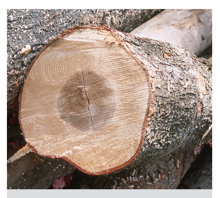
AHEC highlights the value of a "risk-based" approach

AHEC has subsequently used this data to inform LCAs of finished products and structures containing U.S. hardwoods regularly undertaken for AHEC demonstration projects. The AHEC website hosts an <u>LCA tool</u> providing easy access to environmental impact data on selected American hardwood species and thickness to the overseas customer using the specified transport route.