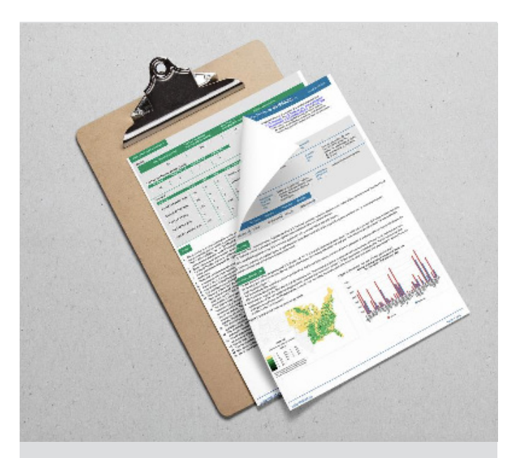
The AHEP system provide AHEC members with species-specific data

reported for EUTR and similar regulations, alongside sustainability data from the FIA, the LCA and the Seneca Creek Assessment, to their overseas customers. AHEPs can be issued by AHEC members either for the term of an individual supply contract or for individual consignments of U.S. hardwood exported by AHEC Members to anywhere in the world.